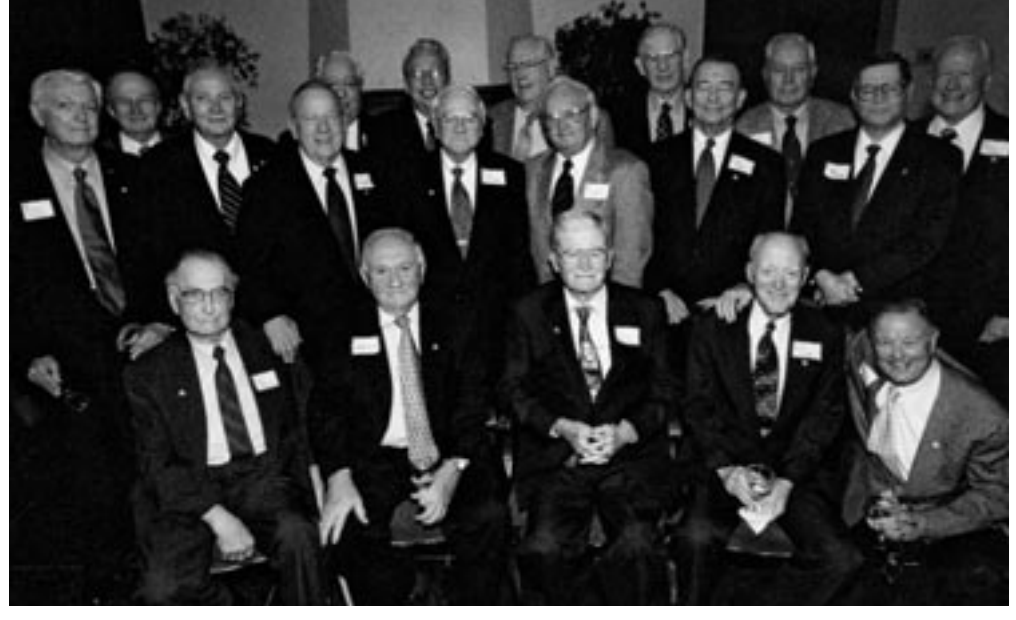
Class of 1951