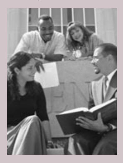
The Career Services Office can help.

Contact us at 225/578-8787 to see how you can begin receiving résumés from qualified students.