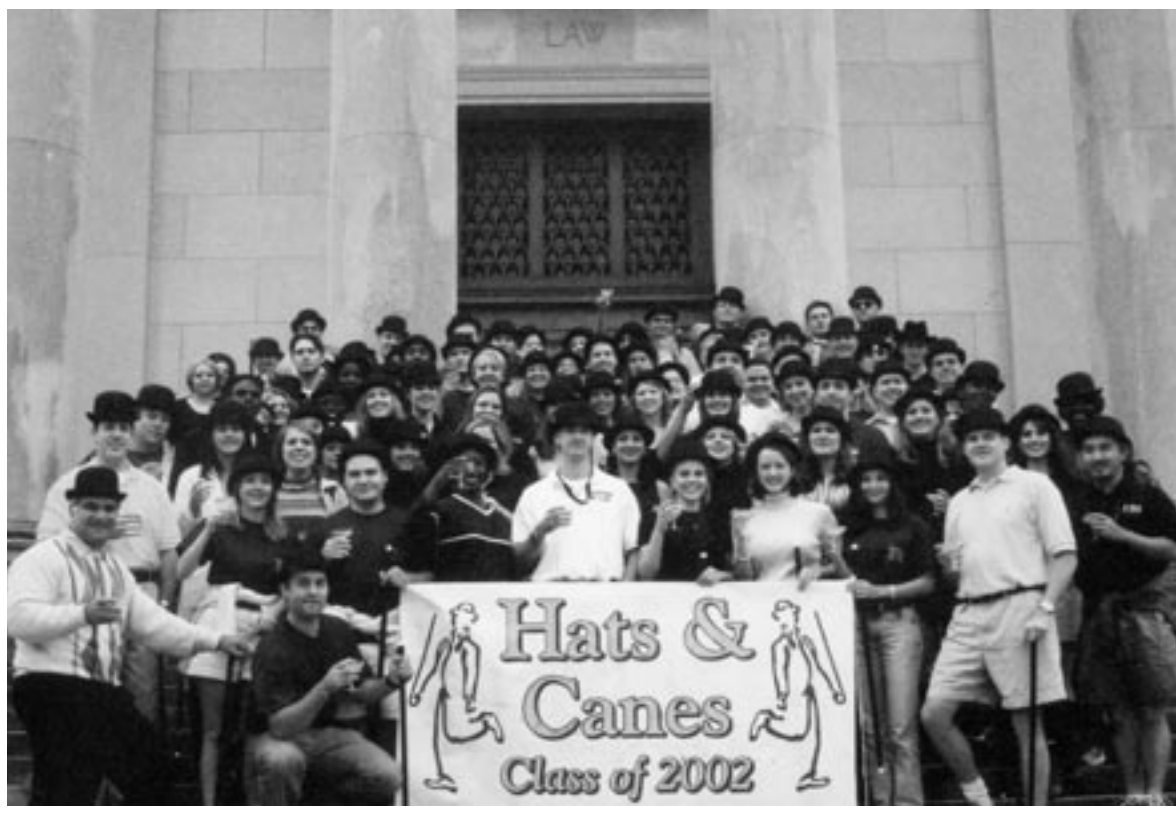
A toast to the Senior Class of 2002!

Prior to the Friday evening reunion parties, alumni participated in a Continuing Legal Education seminar at the LSU Law Center on Ethics and Professionalism. All alumni of the LSU Law Center were eligible to take these free CLE courses host-