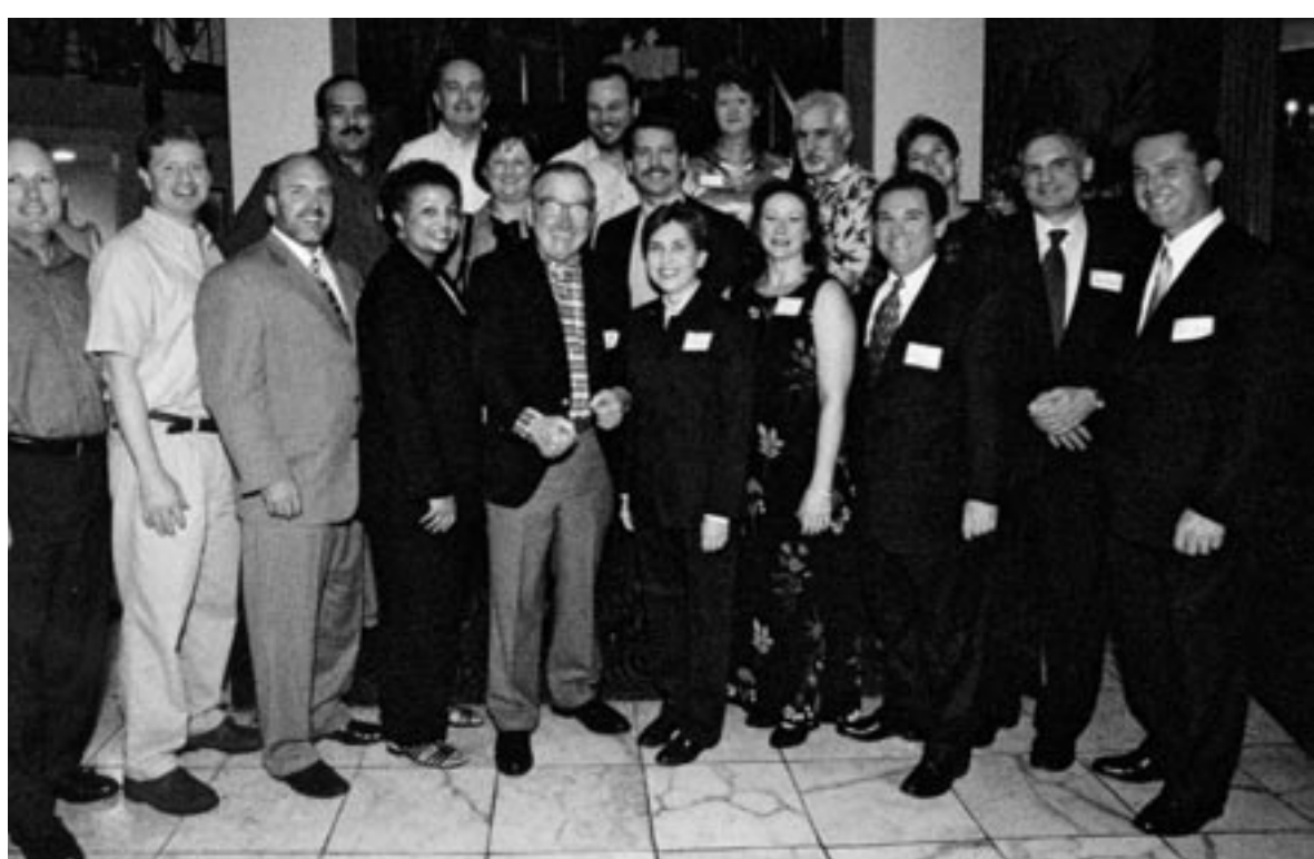
Class of 1981